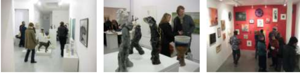
Kingsgate Workshops Winter Show 2008

This has been an exciting and successful year for Kingsgate Workshops Trust: our education and gallery programme has reached over 750 people, with participants reflecting the diversity of our local community.