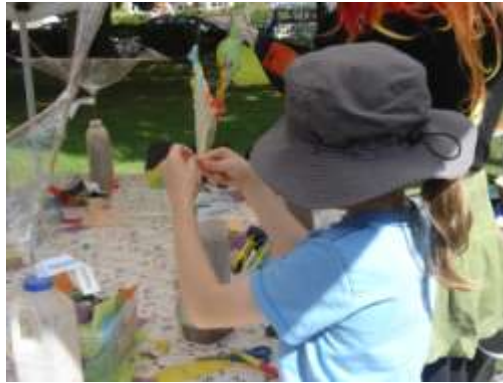
Queen's Park Day 2008

The Operations Manager values the positive communication received both through formal channels and through informal day-to-day contacts with studio-holders (licensees). The Operations Manager relies heavily on the work of the (licensee) Management Committee; in turn, support for all such activities continues to form an important part of the Operations Manager role. The Management Committee has continued to meet regularly throughout the year, and receives regular oral reports from the Operations Manager.