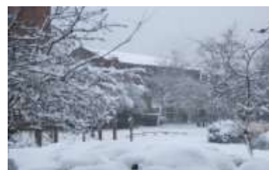
Kingsgate Workshops Buildings in summer and in winter