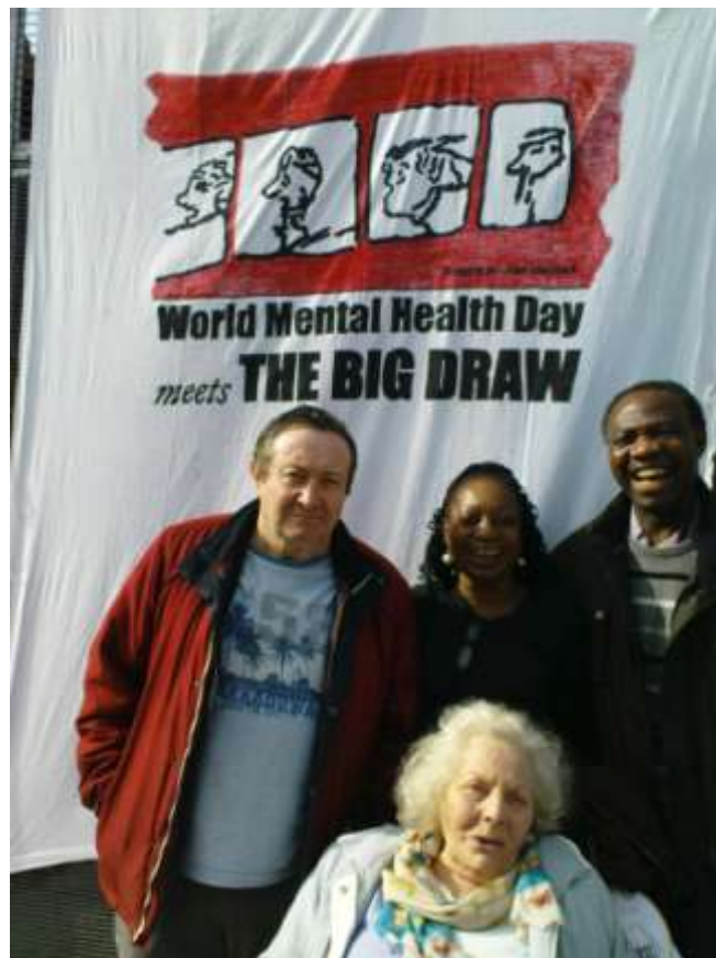
"The Big Draw" on World Mental Health Day in the KWT Education Building

Our charity's priority is to deliver educational opportunities to the local community and in particular to the residents of the boroughs of Camden and Brent. We make a difference by enabling local people to access high-quality educational opportunities and experiences that they would not otherwise have. Kingsgate Workshops Trust works with adults and young people from some of the most deprived communities in the area. Many of the people who benefit from our projects suffer from severe, multiple deprivation and social exclusion. Our free events and outreach projects are specifically tailored to the needs of these groups.