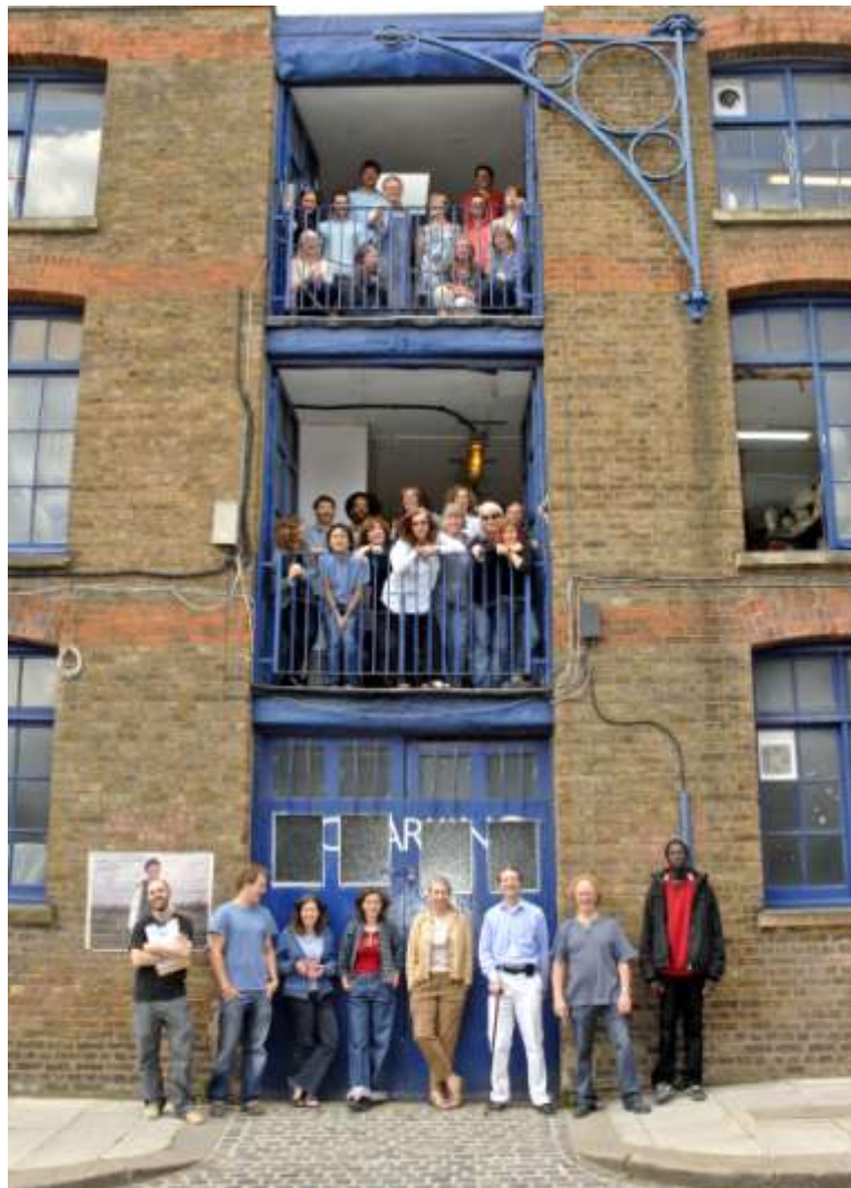
OPEN STUDIOS 2008 – our 30 th Anniversary